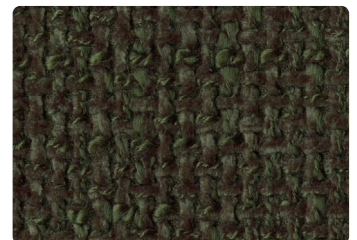
018HER Olive Green