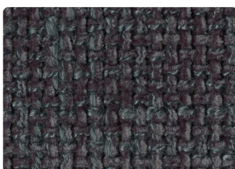
011HER Dark Grey