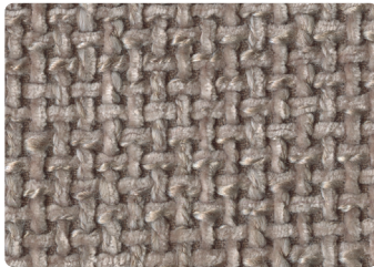
003HER Light Taupe