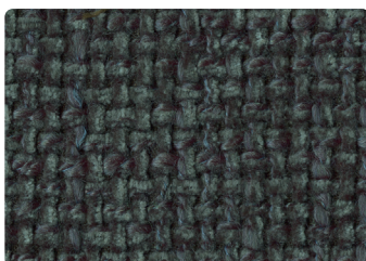
016HER Emerald Green