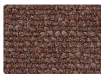
12HL Red Brick