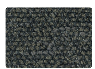
07HL Dark Grey