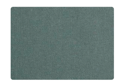
140EVA Sea Green