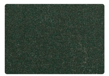
144EVA Bottle Green