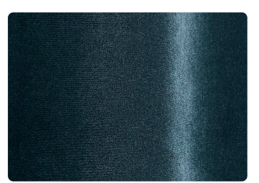
170EVA Night Blue