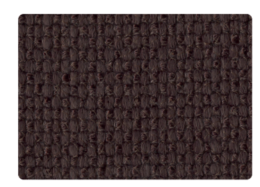
04Cl Dark Brown