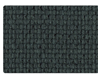
05Cl Alp Green